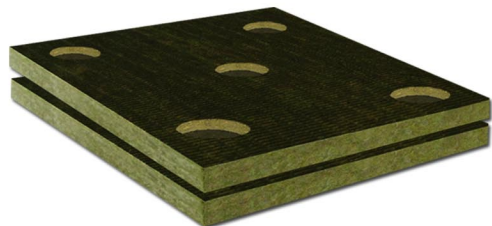
Available Flat or Tapered